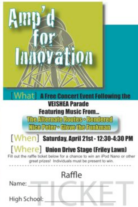
Above: Sample event flyers.